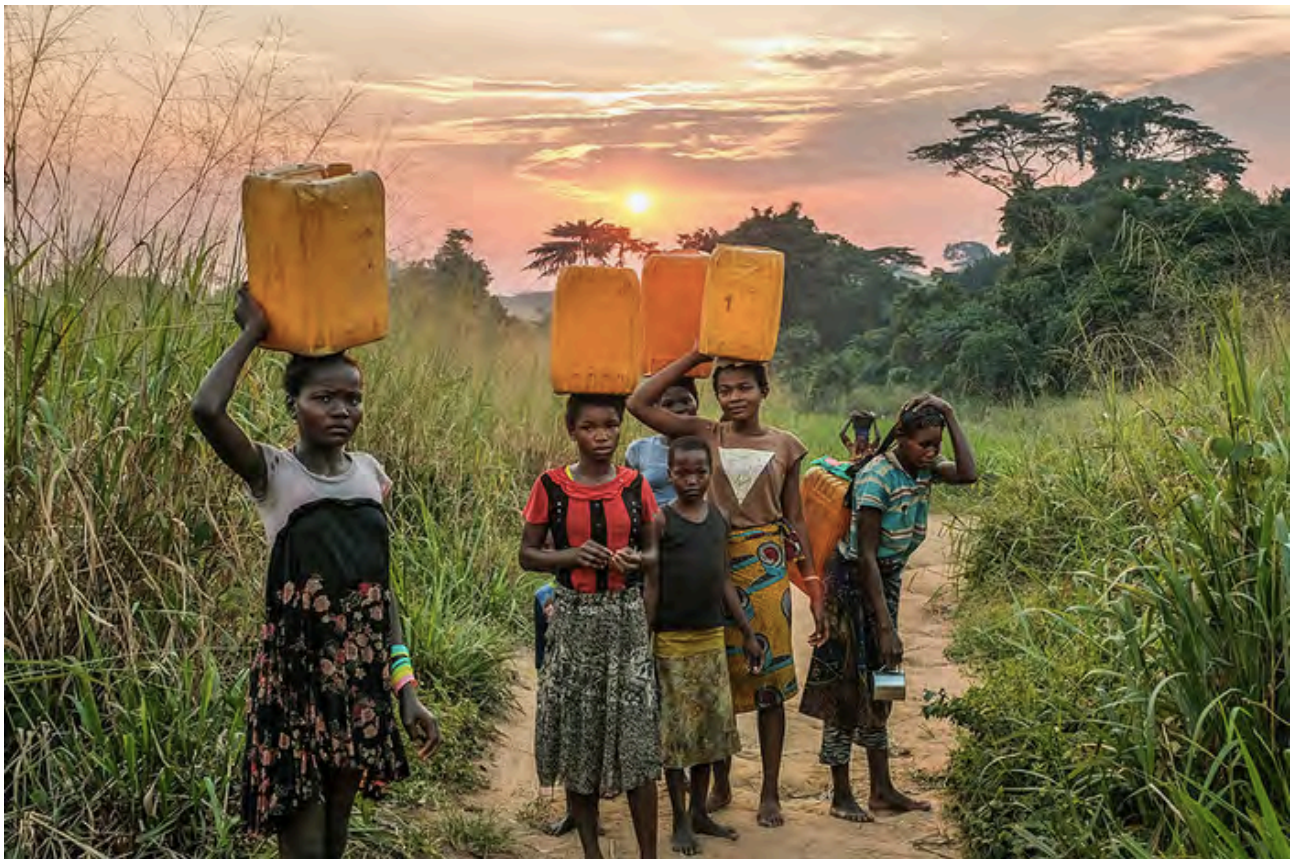
Carrying water from a source near Yangambi, DRC. Photo by Axel Fassio/CIFOR (as cited in Evans, 2018)