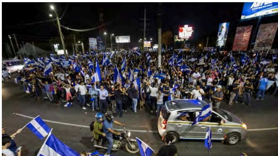
Nicaraguan Farmers marching to Managua declaring: "Daniel out!"

The number of deaths associated to riots against the government of Daniel Ortega has risen to 42 according to the official numbers given by the Centro Nicaragüense de Derechos Humanos (CENIDH).