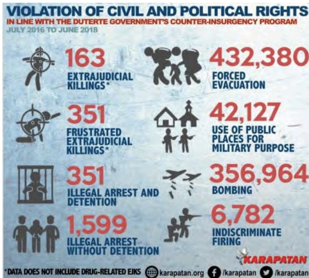
Data provided by Karapatan showing the total violation of civil and political rights between July 2016 and June 2018. These figures do not include drug-related extrajudicial killings (as cited in Karapatan, 2018e).

months it placed 3 army battalions in our ancestral lands, intensified its campaigns for the closure of community schools and harassment our teachers, students and parents, and now waggles Datu Guibang as a surrendered leader.” (IPHRD Net, 2018b)