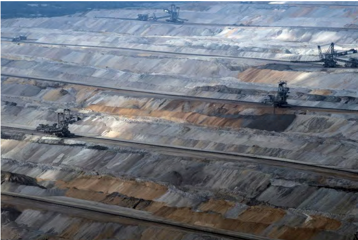
Mining continues over the remaining forest. (Photograph by Henning Kaiser, dpa, AP; as cited in Donahue, 2018)

Ancient Forest Home of Squatter Communities Is Doomed by Coal Published on the 13th of April, 2018 (Coal)