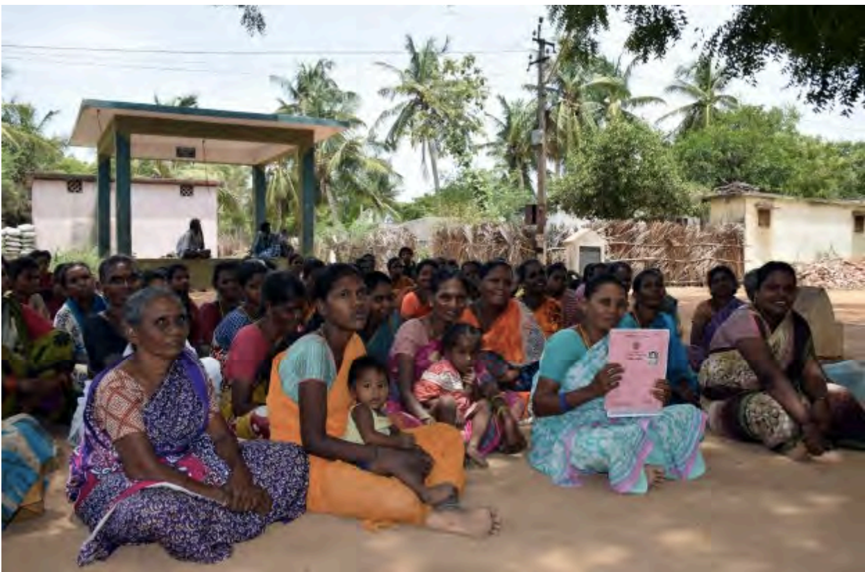
The women of Macharawari Pallem, a village of the Yanadi indigenous people located some three hours from Chennai city in South India, finally re-claiming their land after being award it over two decades ago and grabbed later by landlords and village elites.