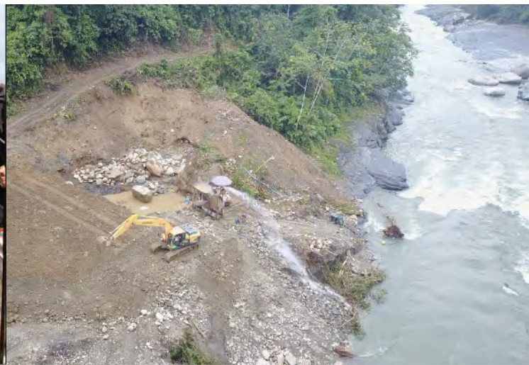
Left: “Members of Sinangoe’s guardia indigena established last year to protect their territory from miners and others.” Right: “The mining site recently discovered by the A’I Cofan upriver from Sinangoe.”