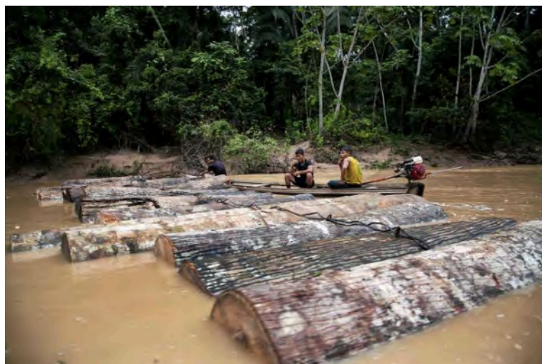
Asháninka men float on logged trees down the Putaya River, near the hamlet of Saweto, Peru.

Published on the 17th of January, 2018 (Deforestation)