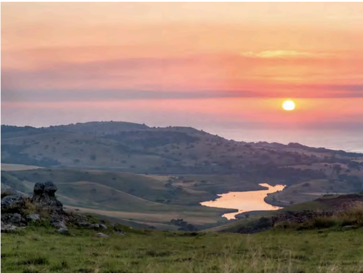
Pondoland: as well as a multitude of endemic species, visitors are attracted by whales off the coast and rugged inland landscape.

"Mbuthuma feels threatened by the supporters of the mining project." (Watts, 2018)