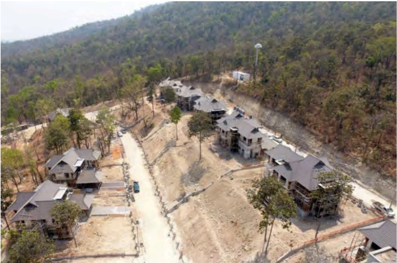
Partially constructed houses within the Court of Justice's 955-billion-baht housing project in Chiang Mai. PHOTO: TEERASAK RUPSUWAN (as cited in The Straits Times, 2018)