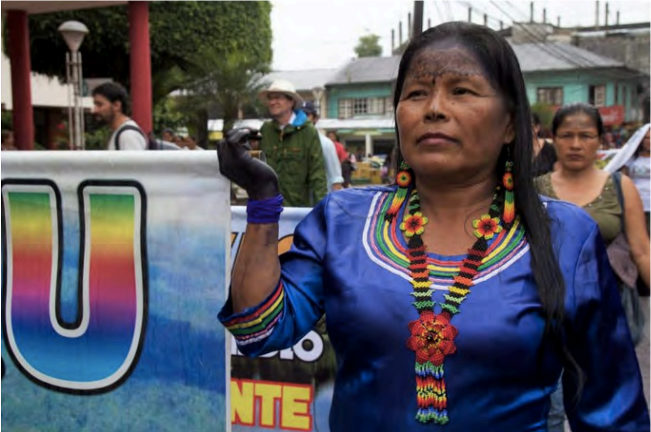
Indigenous women march in Puyo, Ecuador on March 8, 2018. (Photo by Kimberley Brown/Mongabay; as cited in Volckhausen, 2018)