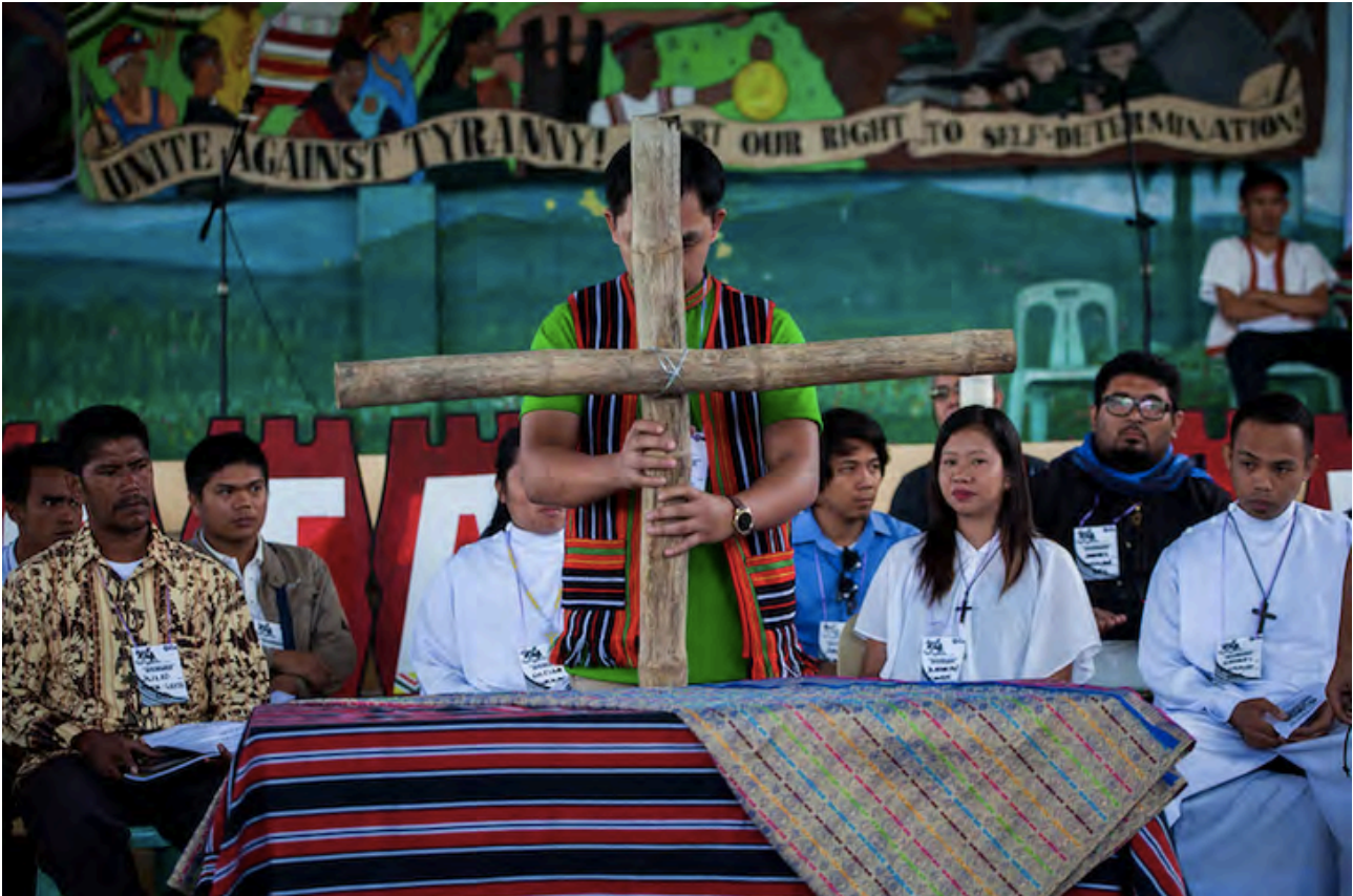
“A tribal leader places a cross on the altar during a celebration on April 22 to mark past victories of Philippine tribes against so-called development aggression in tribal lands.”

the Cordillera mountain range and flows down to join the Cagayan River.”