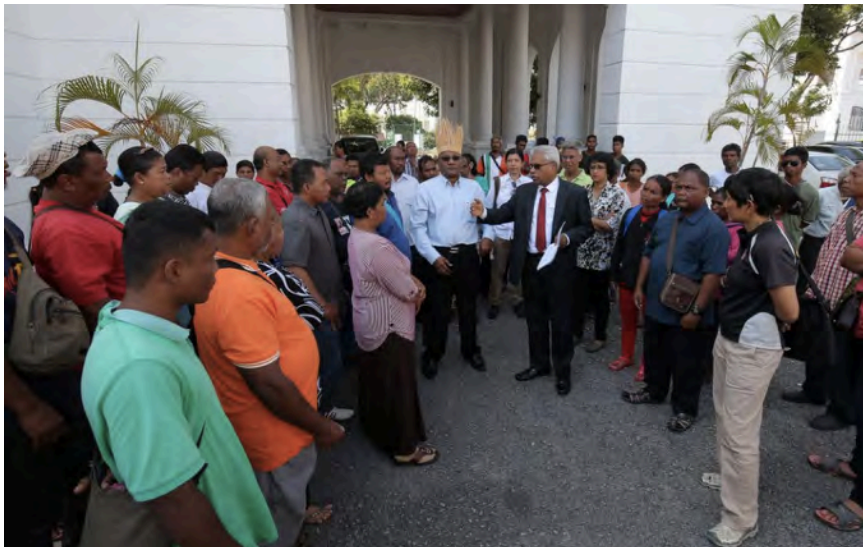
Thirty-five orang asli settlers from Ulu Geruntum, Gopeng gather outside the High Court in Ipoh, after filing suit against the Federal government and the Perak state government, April 25, 2018.

“A group of 35 orang asli settlers from Ulu Geruntum, Gopeng filed a suit against the Federal government and the Perak state government and four others at the High Court... over the construction of a hydropower plant on their ancestral land... for infringing the community's rights on 63ha of the affected land — which they claim was cleared without their consent.”