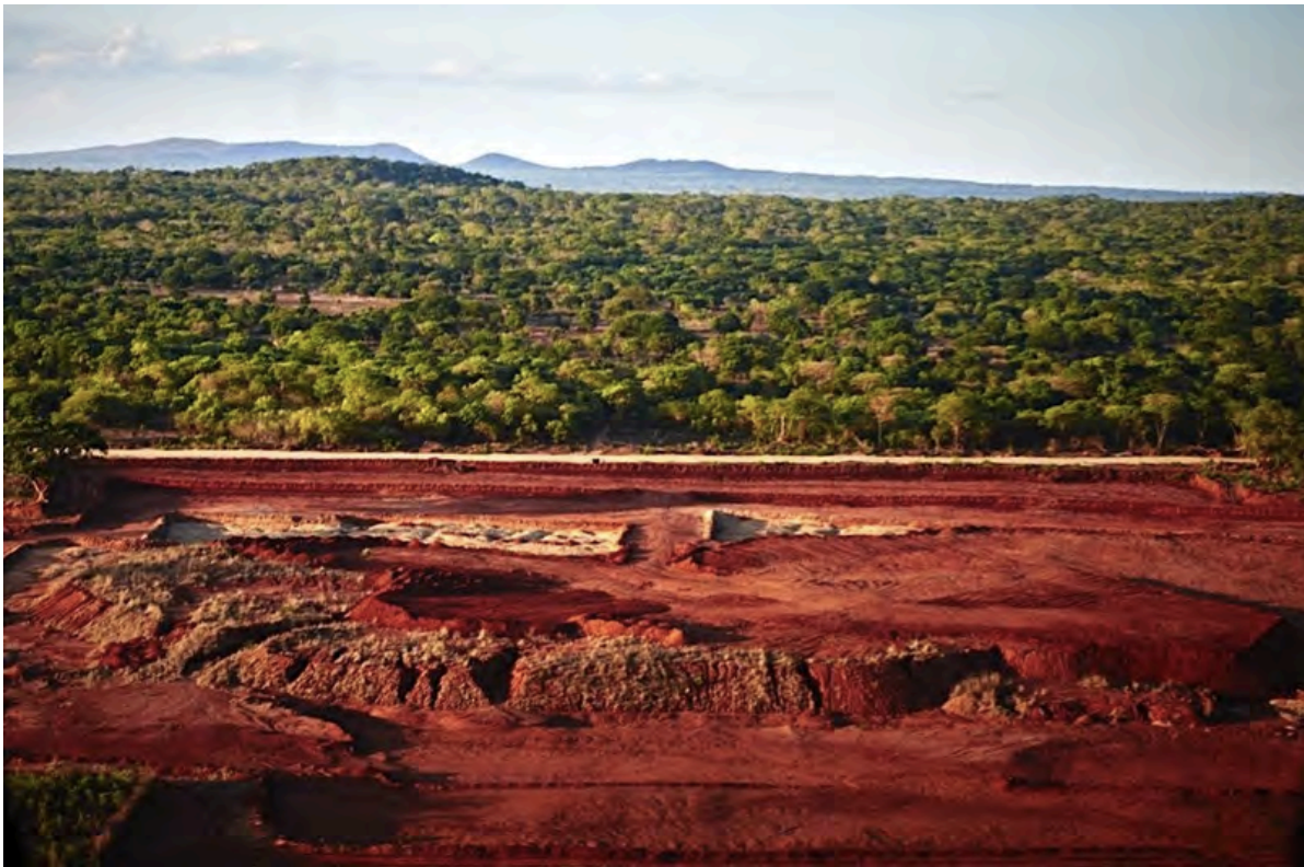
Montepuez is an open-pit mine, considered the world's most lucrative ruby operation. (Image courtesy of Gemfield; as cited in Jasamine, 2018)