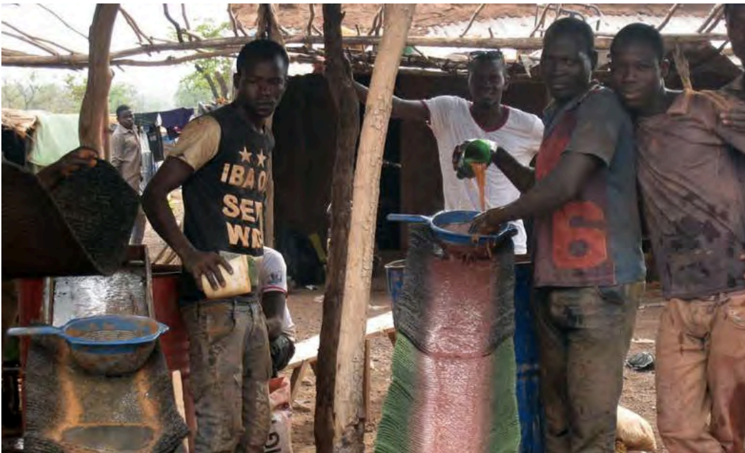
Senegalese gold miners process their ore to extract gold.