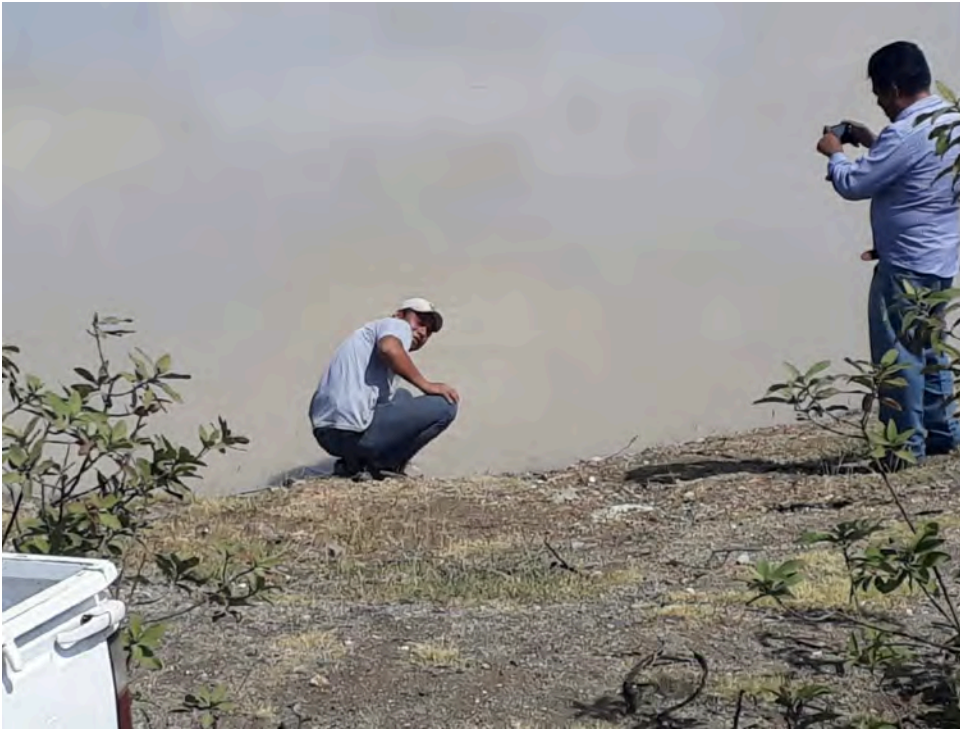
Residents of Magdalena Ocotlán take samples of water contaminated by the Canadian-owned "San José" mine.