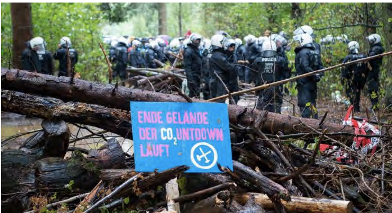
German police on Monday continued evicting environmental demonstrators from the disputed Hambach Forest between the cities of Cologne and Aachen.