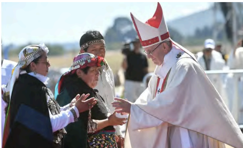
Pope Francis greets Mapuche people during a mass at Maquehue airport, near Temuco, Chile, on Wednesday.