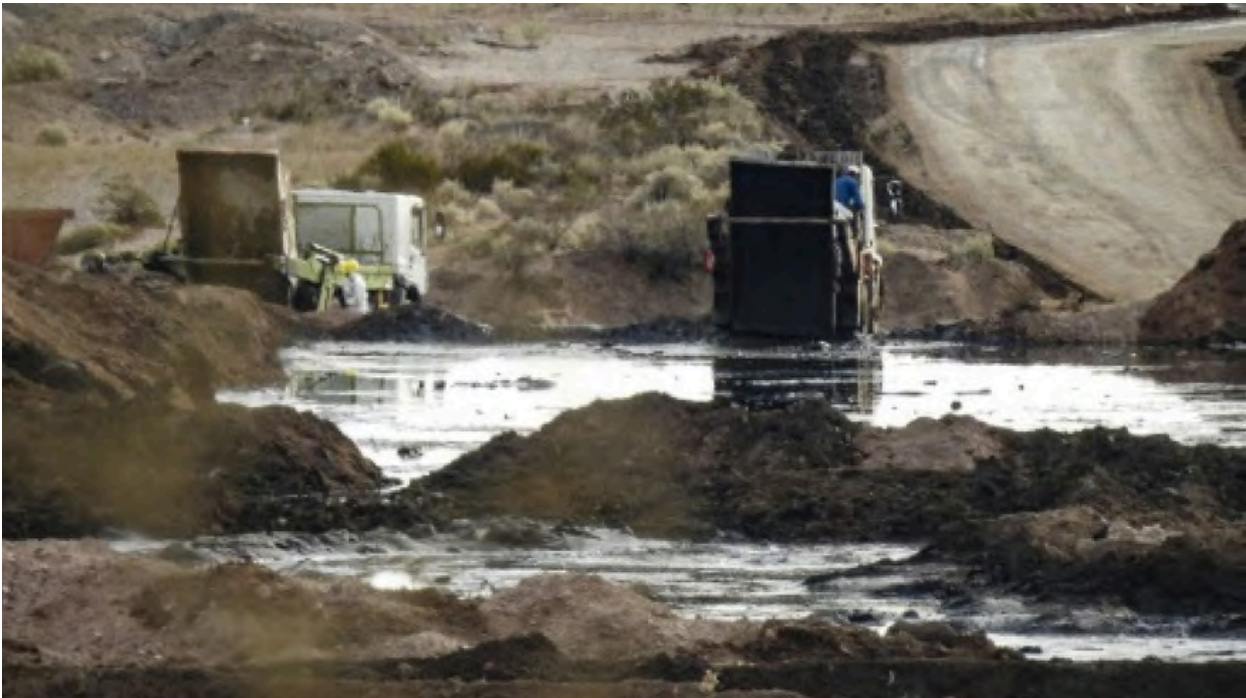
This handout photo distributed by Greenpeace on December 17, 2018 shows an illegal waste dump, where toxic fracking waste chemicals are poured in Vaca Muerta, Neuquen province, Argentina