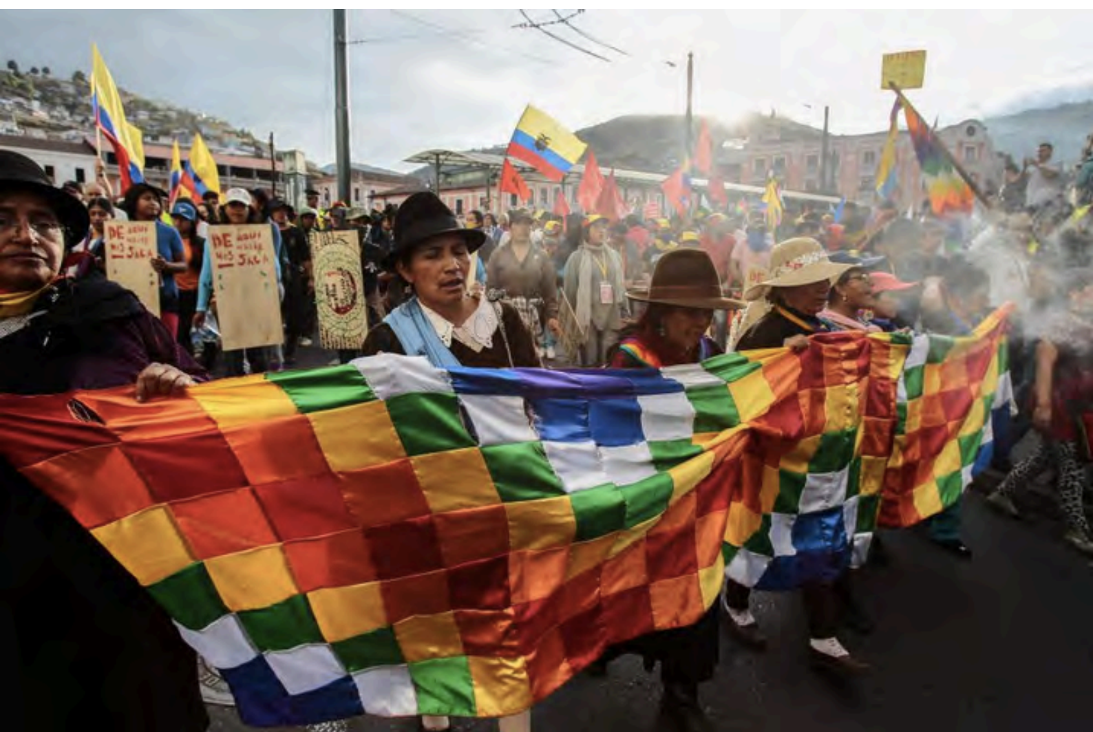
Indigenous people arrive in Quito after marching for 10 days to protest new mining and water law initiatives, as well as a constitutional reform project that would have allowed for indefinite reelection of the president.