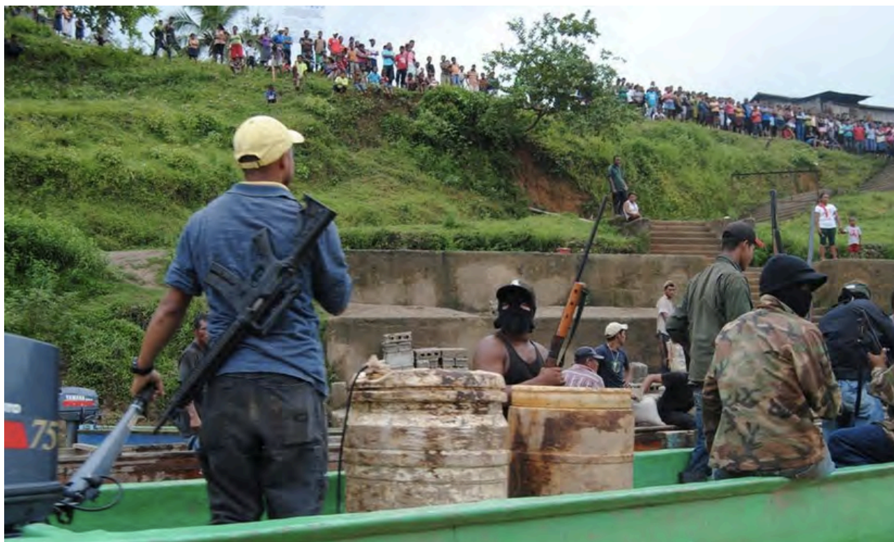
The conflict between Miskitos and settlers