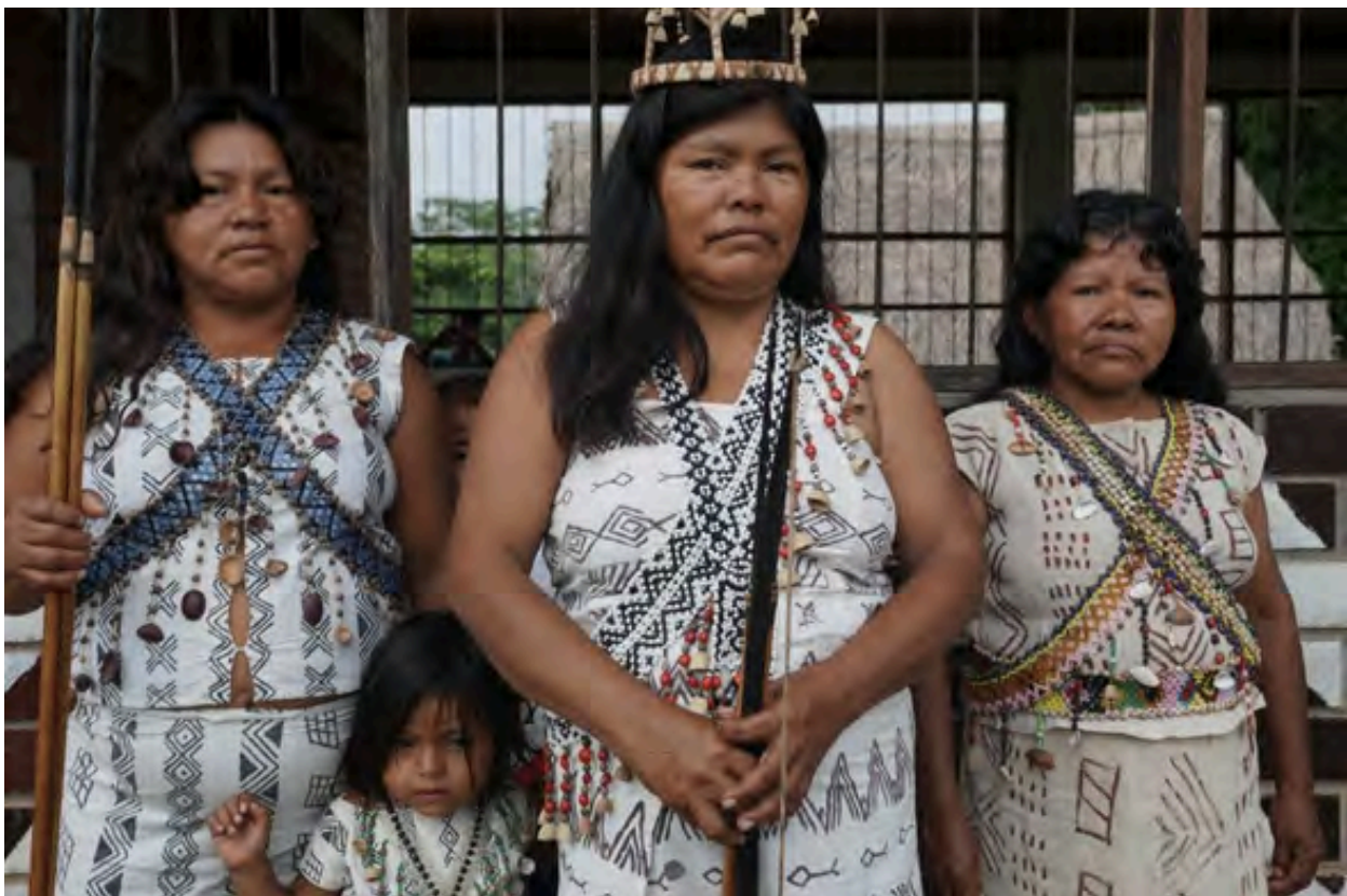
Kakataibo women stand with ancestral weapons in Sinchi Roca, Peru on November 9, 2017.