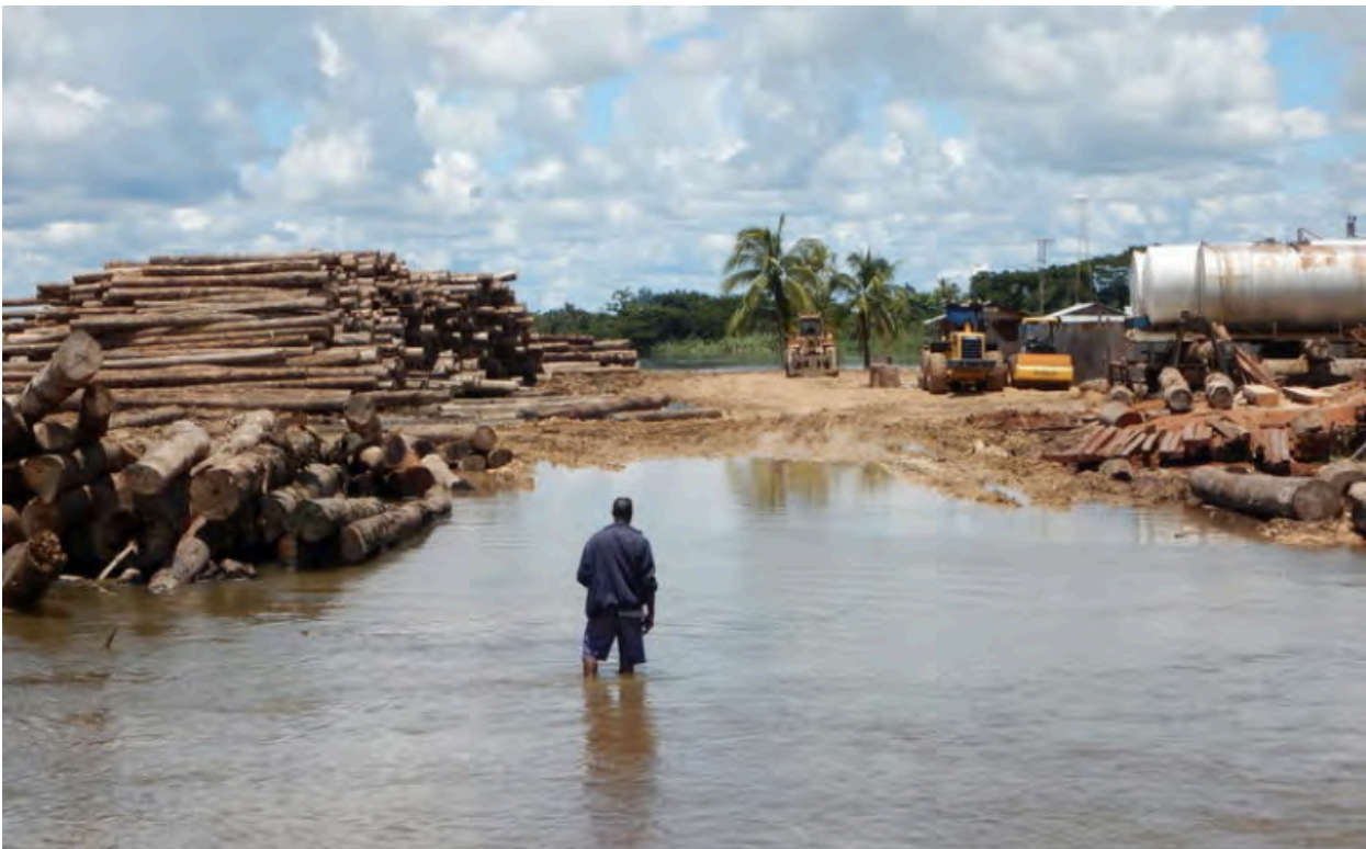
Logging piles on the Sepik River in Papua New Guinea.