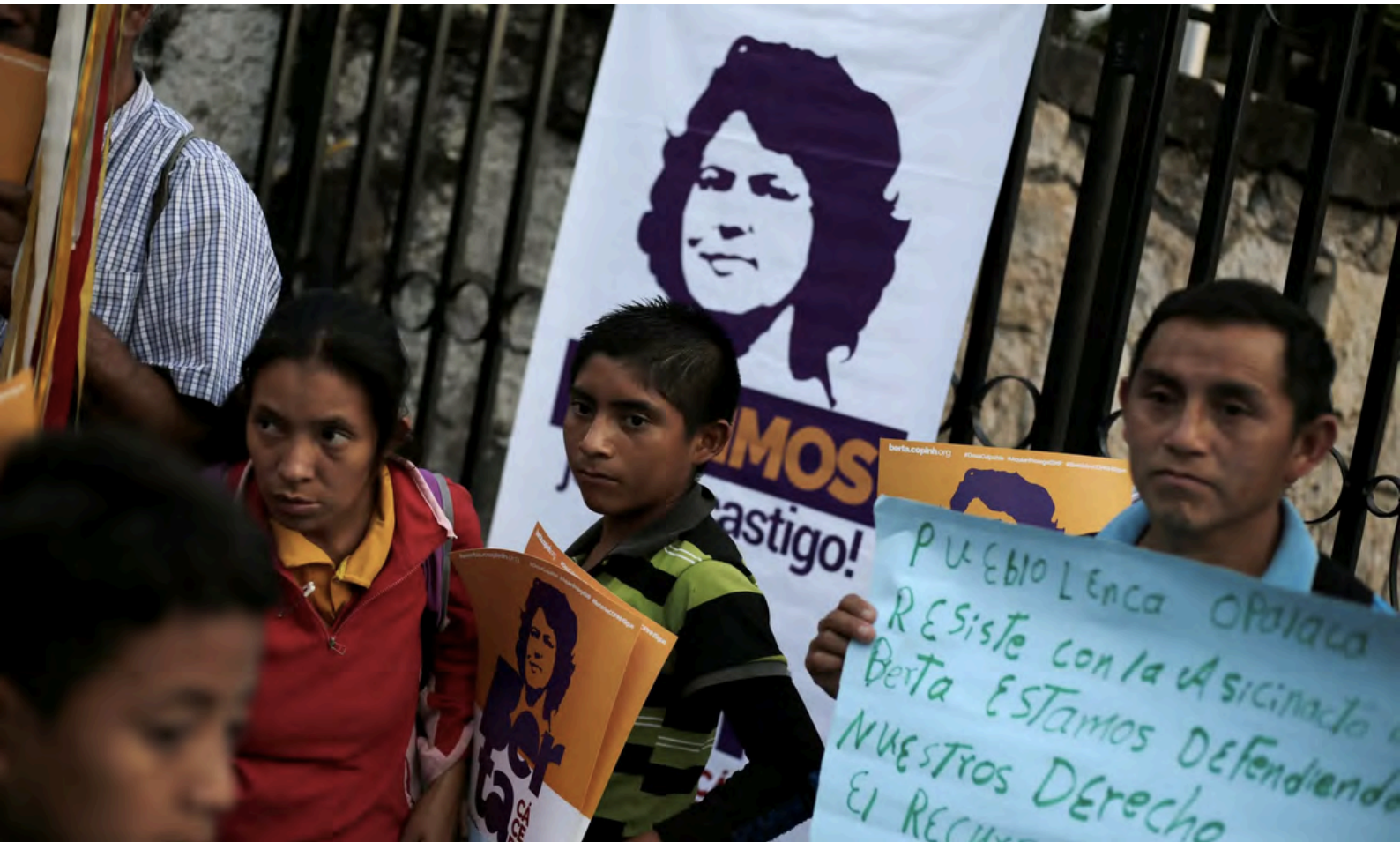
Demonstrators outside court during the murder trial of activist Berta Cáceres in Honduras.