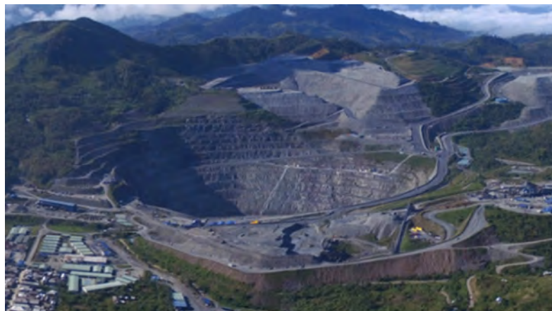
OCEANAGOLD. A mining pit operated by OceanaGold. (Image from oceanagold.com ; as cited in Dullana, 2018)