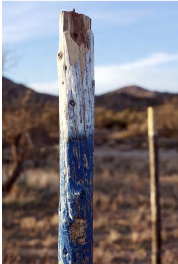
A cross is left vandalized at a prayer site at the Oak Flat Campground in Superior, Arizona.

“A broad coalition of environmental organisations reaffirmed its commitment to stand with the Gwich’in to defend the Arctic Refuge and the wildlife, wilderness, recreational and cultural values it was established to protect.” (Earthjustice, 2018)