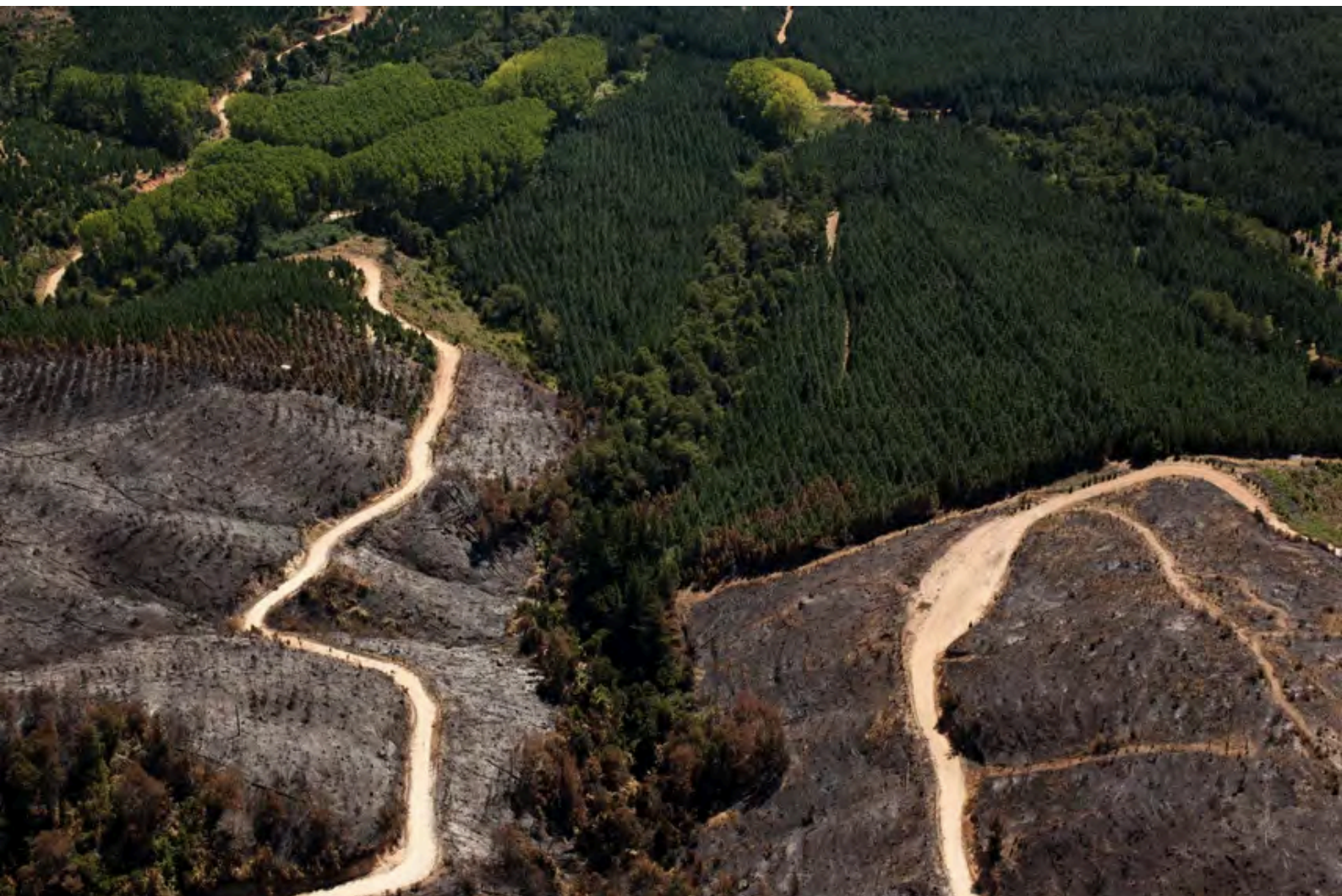
The destructive results of a forest fire started by Mapuche radical groups. (Photograph: Rodrigo Abd/AP; as cited in Youkee, 2018)