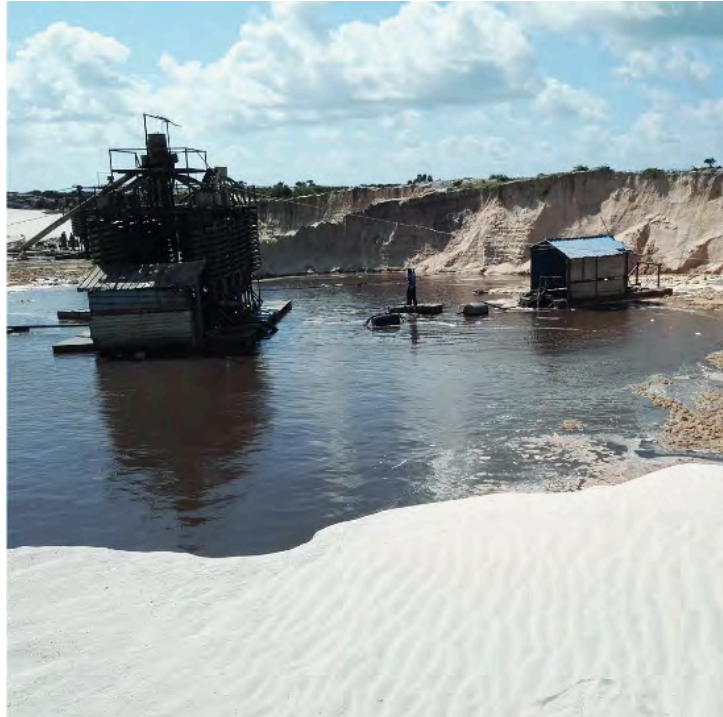
Haiyu Mozambique Mining Co. Lda heavy sands mining operation in Nagonha area, Angoche district, Nampula province, Mozambique

“Vale did resettle some of the communities affected by its Moatize mine, but that resettlement has always been vigorously contested as shoddy and unjust.” (All Africa, 2018)