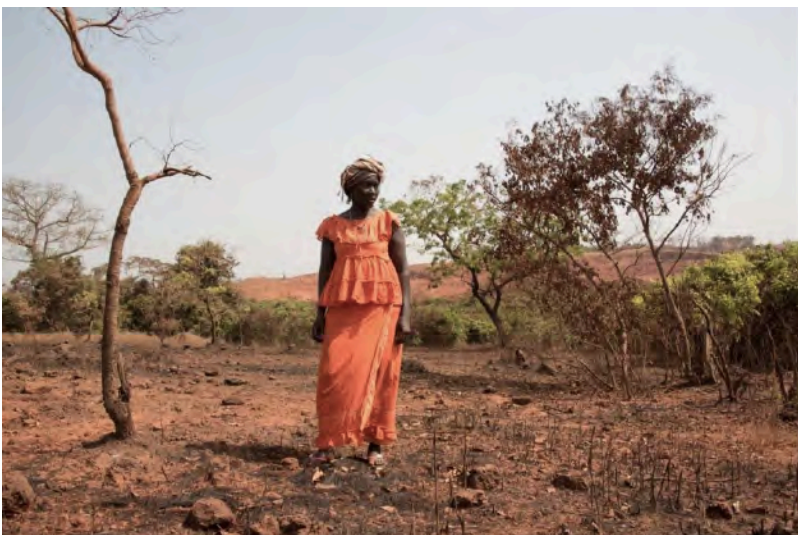
A woman in Lansanayah, a village 750 meters from a bauxite mine owned by La Société Minière de Boké consortium.

© 2018 Ricci Shryock for Human Rights Watch (as cited in HRW, 2018)