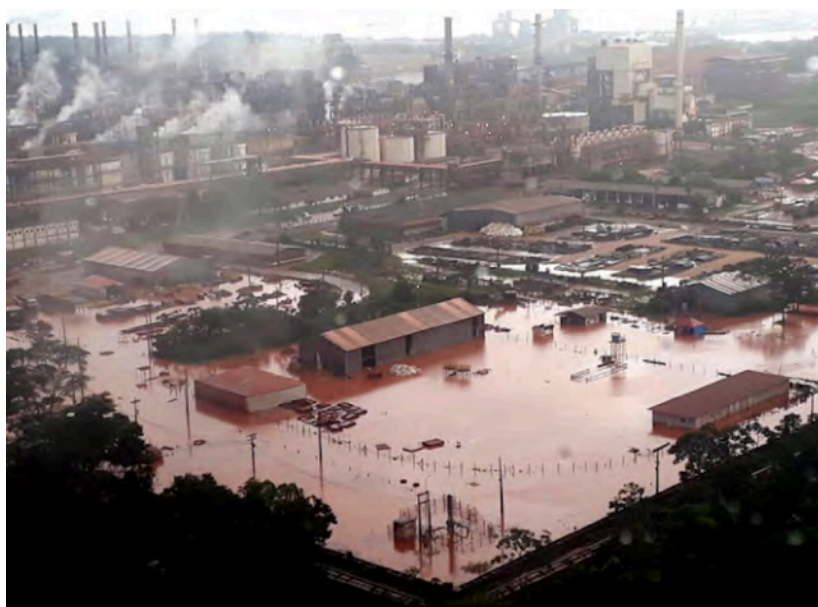
Population in Belem, Para is concerned with the red mud flowing from the Hydro Alunorte compound, photo internet reproduction; (as cited in Alves, 2018)

"after days of vehemently denying any environmental contamination, on Thursday both Para's environmental agency and Hydro Alunorte released statements saying they were looking into the claims. Norway's Hydro is one of the largest aluminum producers in the world, with offices and operations in over forty countries and with more than 35,000 employees worldwide." (Alves, 2018)