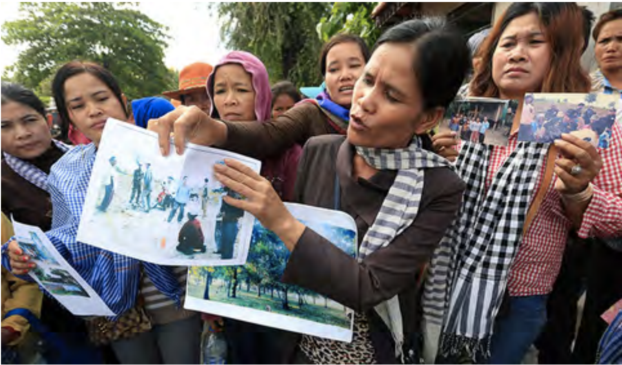
Villagers display photos during a protest over a land dispute.