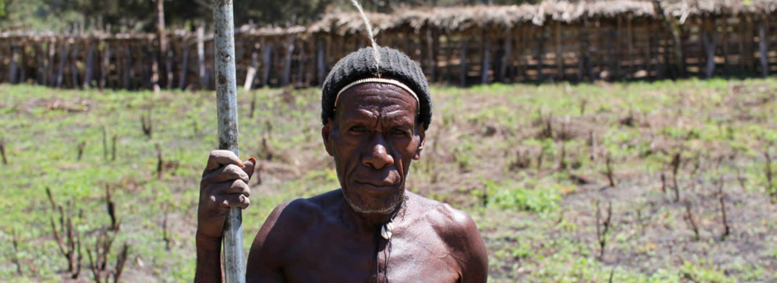
Dani man in Indonesian Papua. (as cited in Jong, 2018d)