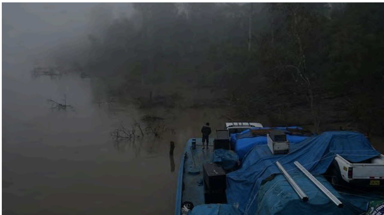
Low visibility and shallow waters often delay the Eduardo II and other ships

"National authorities have championed the Amazon Waterway Project as a silver bullet to the Amazon's chronic underdevelopment. But indigenous groups, fearing threats to food security, safety, and the vitality of their rivers, have met the project with deep scepticism."