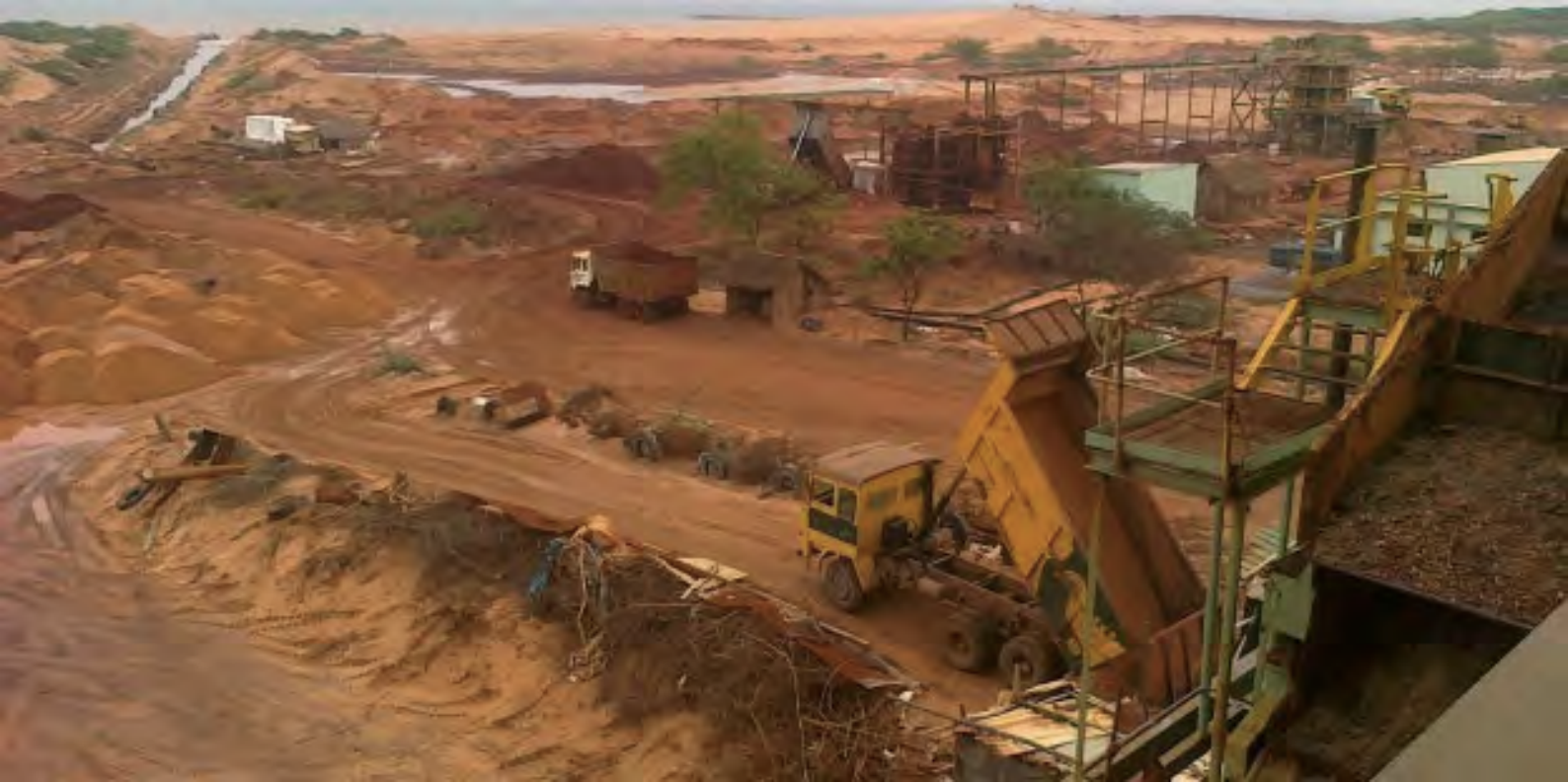
Beach sand-mining along the coast of Tamil Nadu (Photo by Sandhya Ravishankar; as cited in Ravishankar, 2018)

allegedly exonerate the state's powerful sand-mining lobby.”