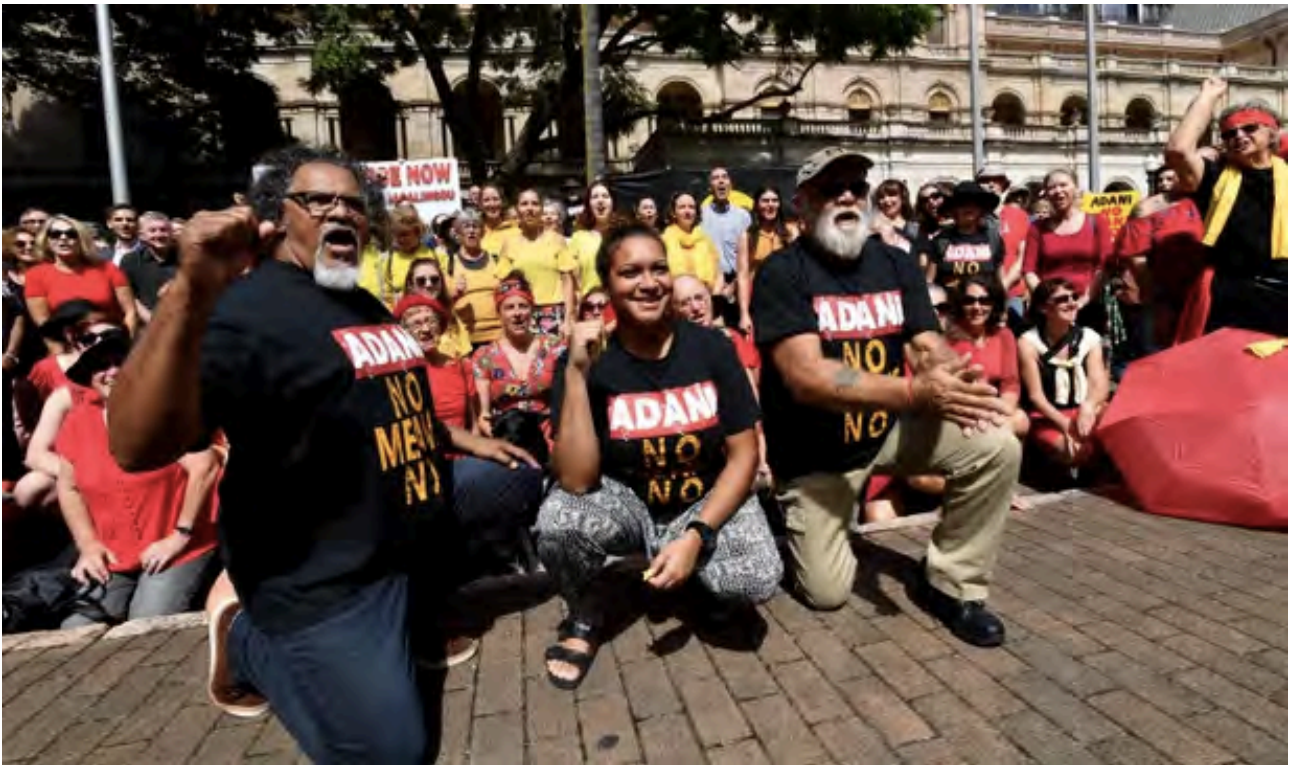
Wangan and Jagalingou traditional owners have lost their bid to block Adani’s Carmichael coal mine in Queensland’s Galilee Basin. Photograph: Darren England/EPA (as cited in APP, 2018)