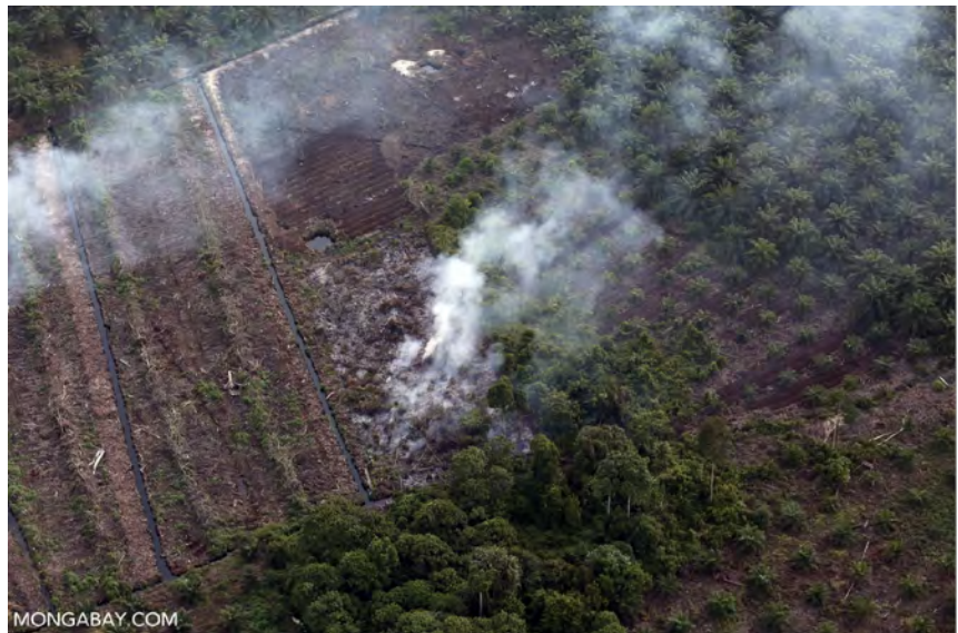
Photo taken on the morning of 29 January 2018 by a local resident (Gyorvary, Suk and Soto Medallo 2018)

Indonesia in 2017: A fighting chance for peat protection, but an infrastructure beatdown for indigenous communities: Published on the 4th of January, 2018