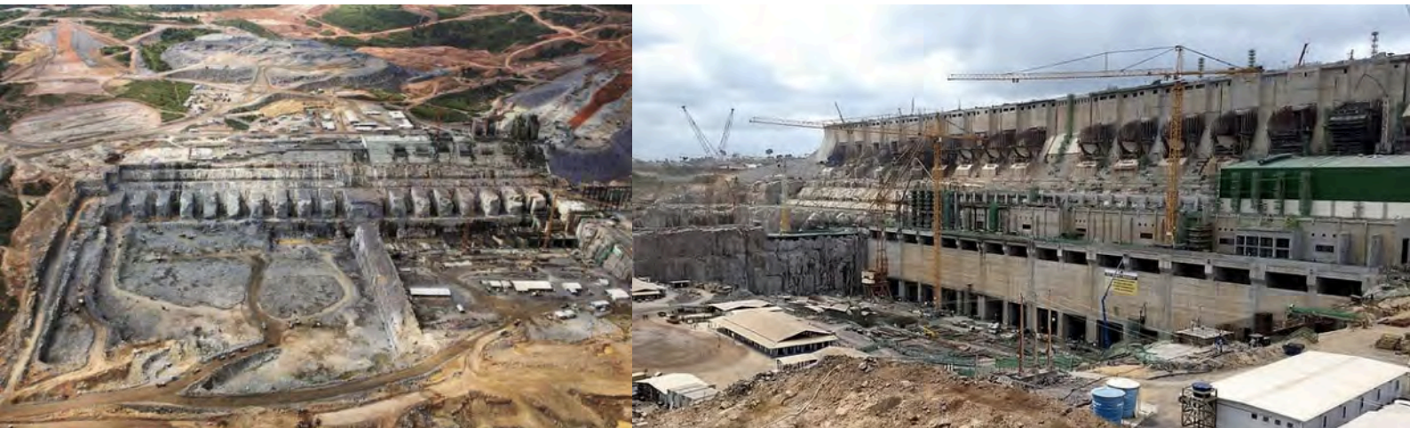
Left: The Belo Monte dam under construction. Belo Monte displaced indigenous and traditional settlements and did serious harm to the Xingu River fishery. Its construction was also cloaked in charges of government and construction company corruption. Right: The Belo Monte mega-dam is one of the most controversial infrastructure projects in Brazilian history, and conflict there seems unlikely to abate soon. (as cited in Nathanson, 2018)