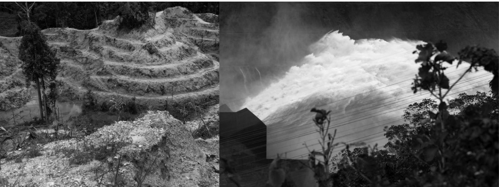
Left: Land that's been logged, stripped bare, and terraced for palm oil plantations near to the Long Jaik longhouse near the Muran Dam. Malaysia, 2018.