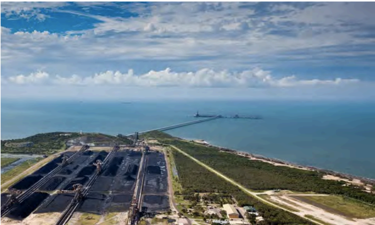
The Abbot Point coal terminal in Queensland, where Adani plans to undertake contentious works.

(Photograph: Tom Jefferson/Greenpeace; as cited in Smee, 2018a)