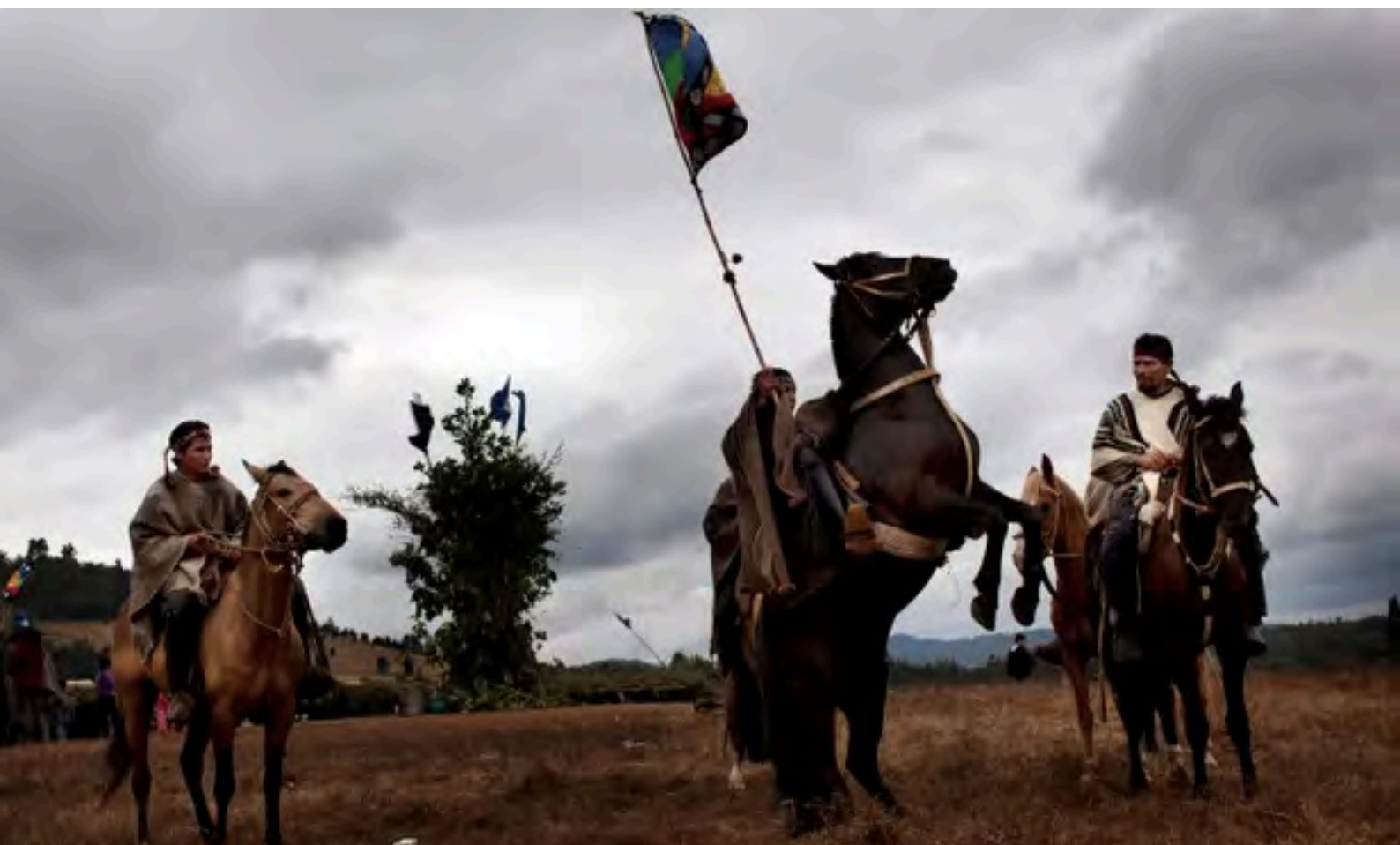
A Mapuche gathering in Ercilla, Chile. The Mapuche are protesting the presence of agricultural firms on their land.

(Photograph: Rodrigo Abd/AP; as cited in Youkee, 2018)