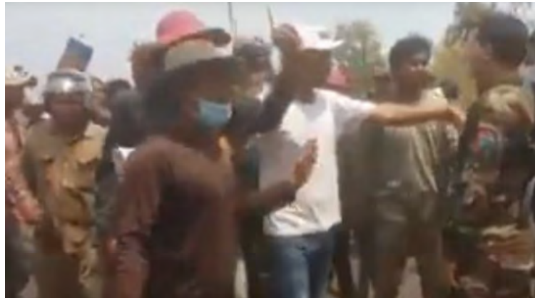
A screenshot from a video showing clashes between security forces and villagers at a rubber plantation in Kratie province. Supplied (Meta, Koemsoeun & Seangly, 2018)