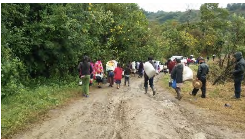
Displaced people from Chalchihuitan, Chiapas, who have been forced from their homes and land by paramilitary groups.