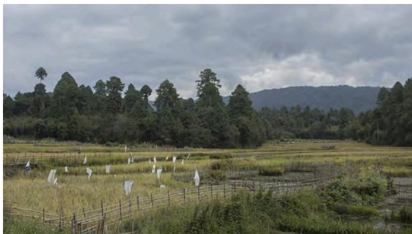
The Arunachal Pradesh Land Settlement and Records Amendment Bill, 2018, which confers ownership rights to indigenous tribal people, was passed by the assembly.