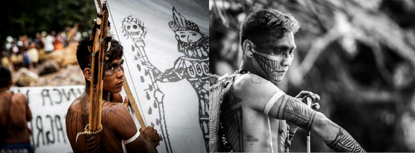
Left: A Mundurucu warrior prepares to occupy the São Manoel dam during a protest. Right: A Mundurucu warrior.

region of Trairão, a municipality in the west of Pará (10.) .