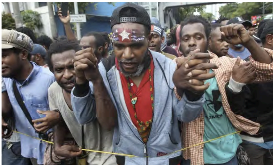
A Papuan activist bearing the banned separatist 'Morning Star' flag rallies with others in East Java on Saturday.

Photograph: Trisnadi/AP (as cited in Davidson)