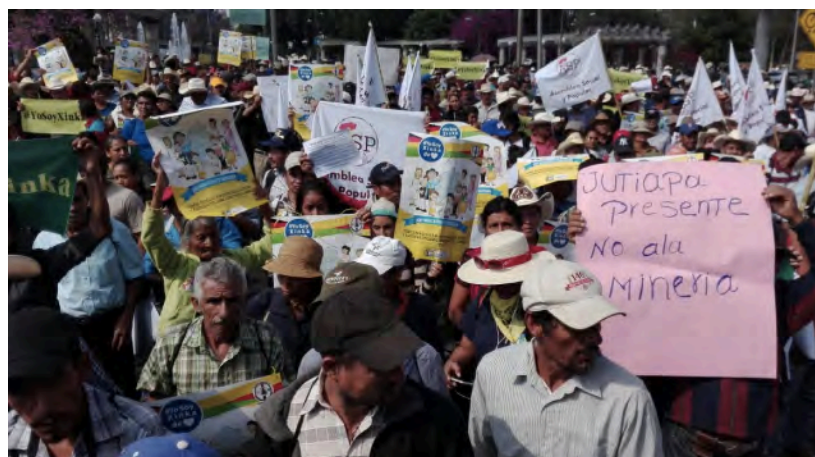
More than 2,000 Indigenous Xinka people march through the streets of Guatemala City on April 9, 2018, to demand an end to Tahoe Resources' Escobal mine.