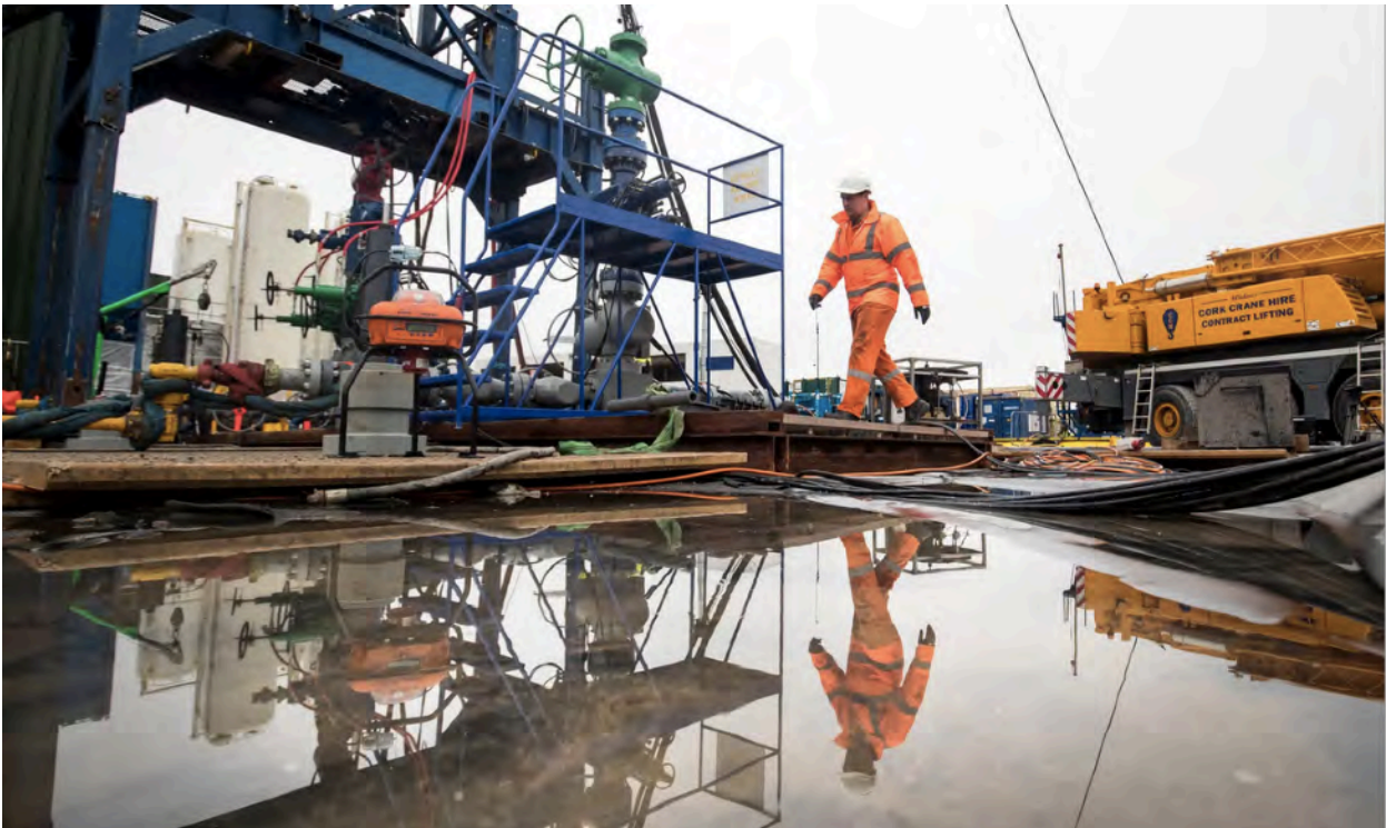
A worker at the Cuadrilla fracking site in Preston New Road, Blackpool.

(Photograph: Danny Lawson/PA; as cited in Vaughan, 2018a)