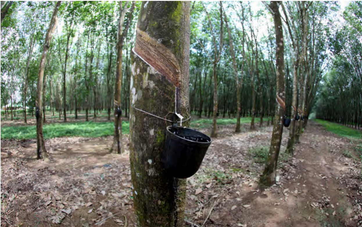
Rubber is produced from the sap of the Pará rubber tree ( Hevea brasiliensis ).