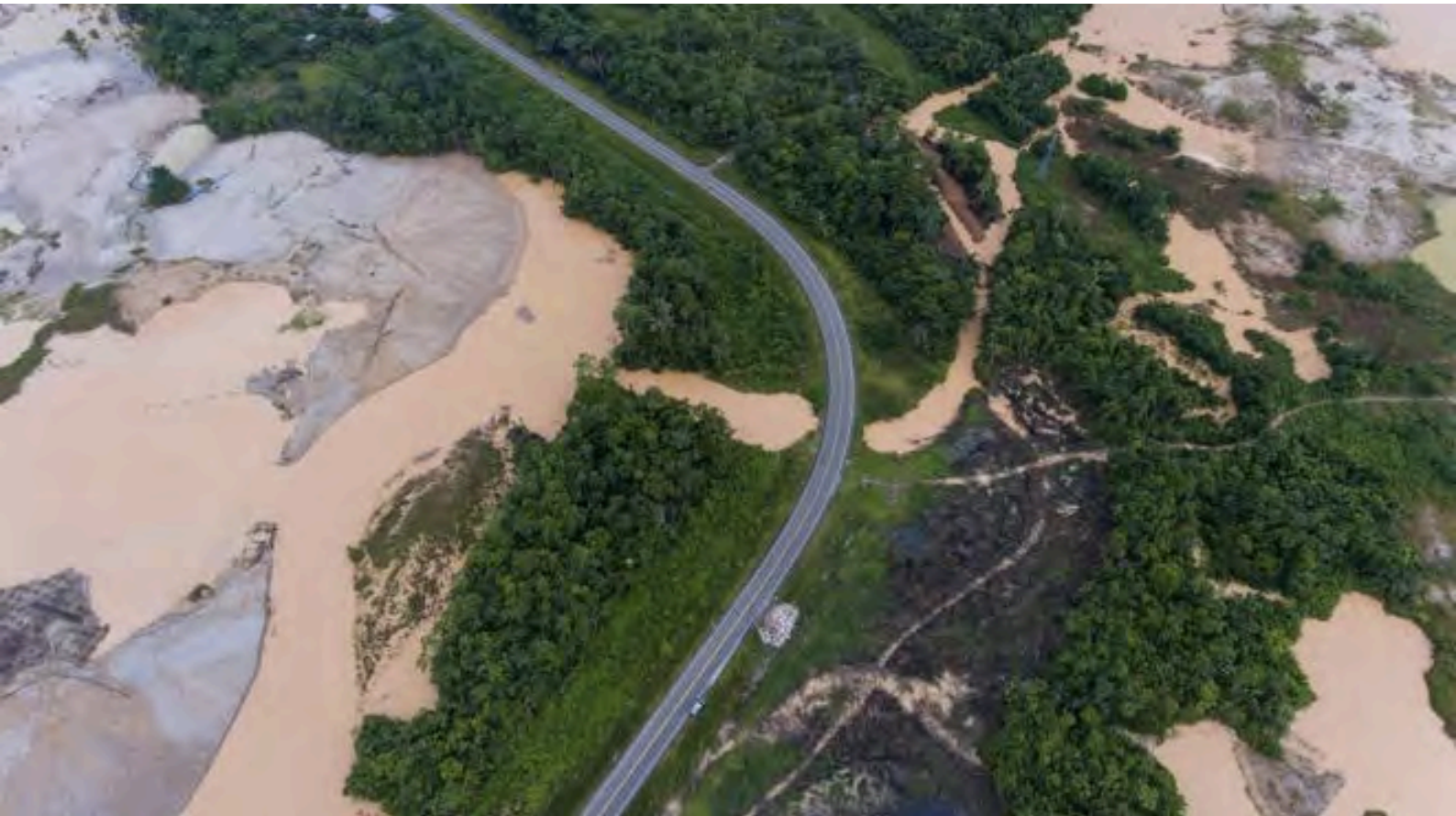
A road cuts through an area deforested by illegal gold mining in the Madre de Dios province of Peru. A plan to build another major road in the area is dividing the country. (Photograph by Rodrigo Abd, AP; as cited in Drake, 2018)