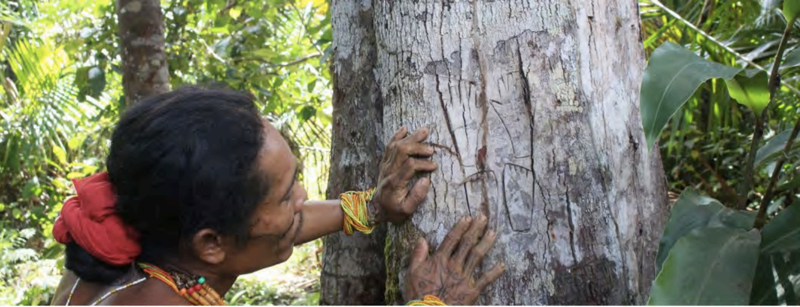
Indigenous Indonesians of Mentawai district depend their lives on the resourceful forests.

“Indonesia’s national commission on human rights has vowed to investigate the death of a journalist who was being held on charges of defaming a palm oil company owned by a powerful tycoon.”