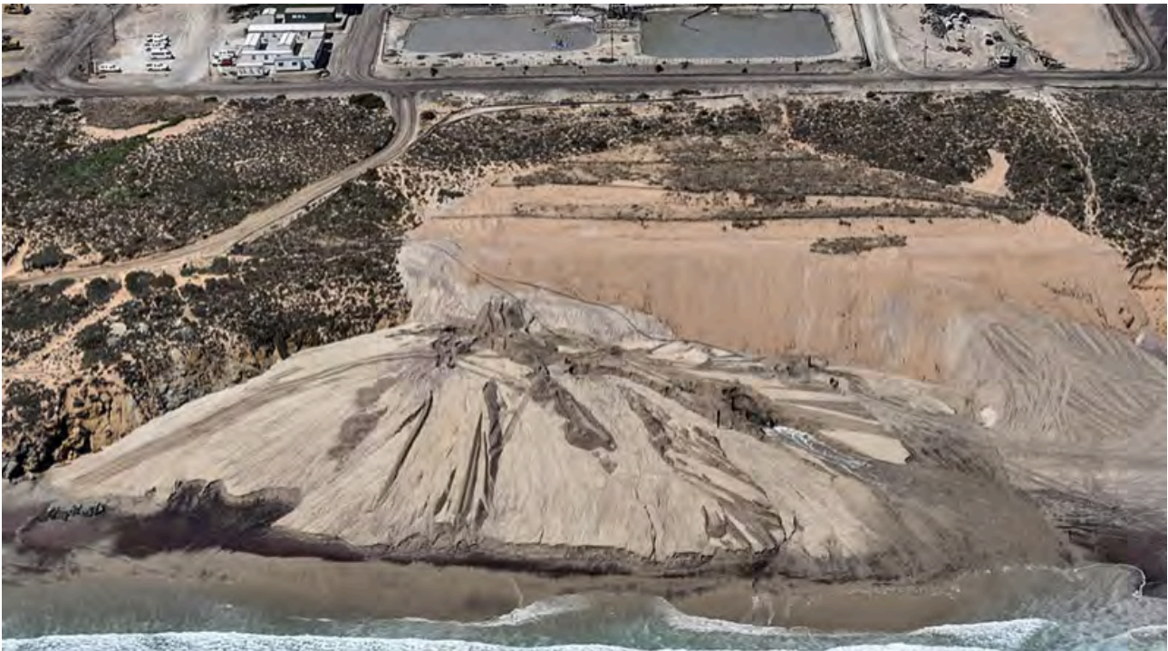
A cliff collapsed by Tormin mine in 2016. (as cited in Pather, 2018)