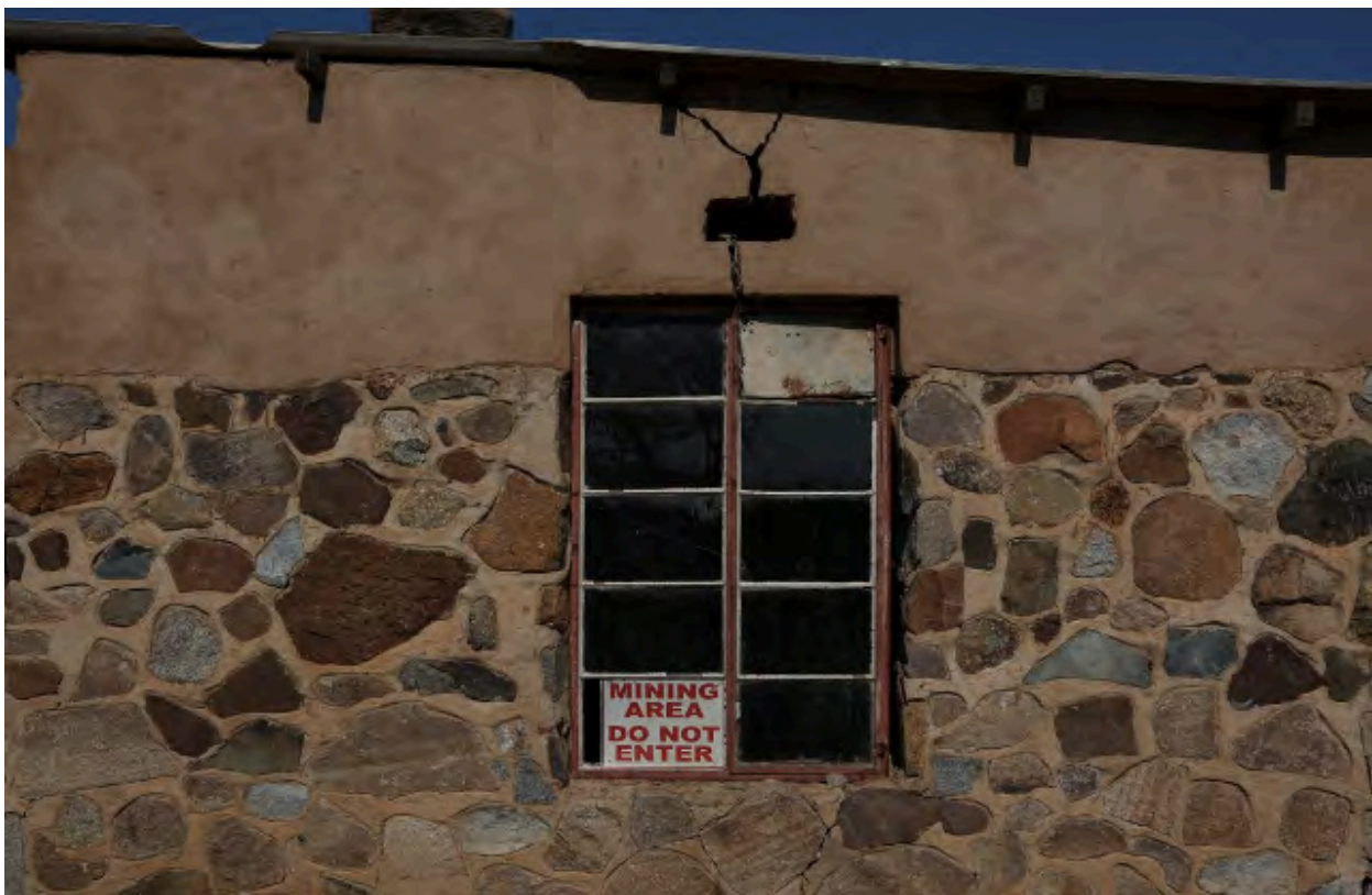
A sign is seen on a window at a village outside a mine in Moruleng, a small mining community, in Rustenburg, Northwest province, South Africa June 27, 2018. (as cited in Stoddard, 2018)