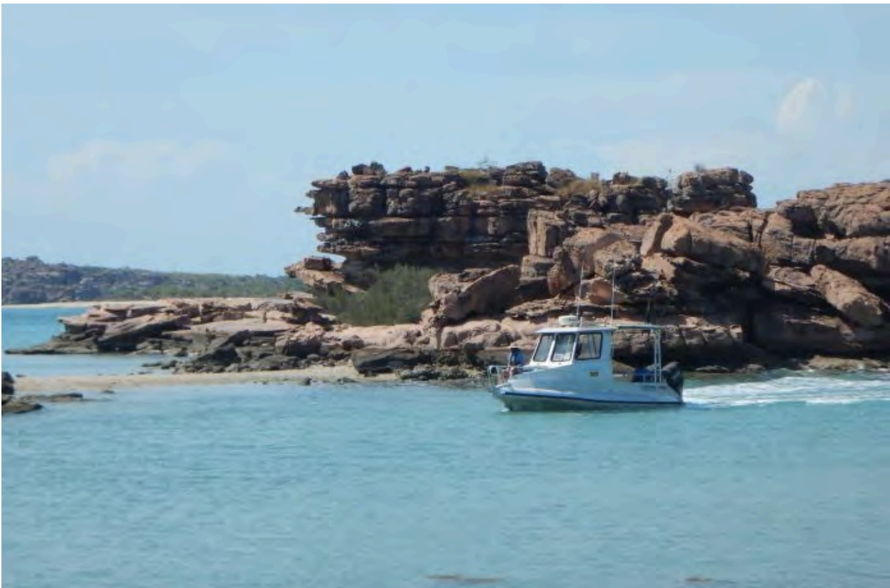
Rangers patrol the waters around Groote Eylandt