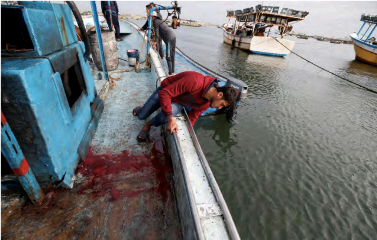
A man inspects a boat in which a Palestinian was killed at the seaport of Gaza city February 26, 2018.

patrols the waters to stop arms from being smuggled into the enclave and to stop militants trying to attack or infiltrate its territory from the sea.” (Reuters, 2018)