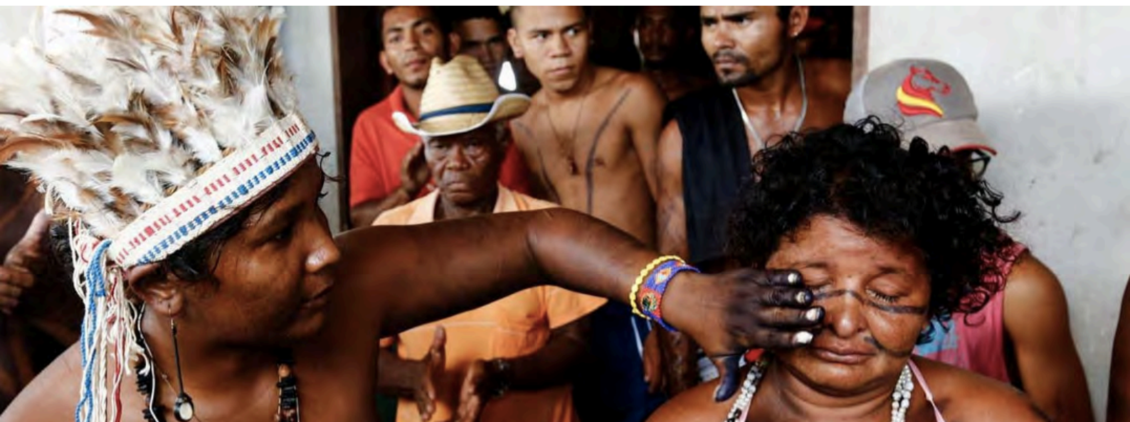
A grieving Akroá-Gamellas woman just after the April attack. Members of the indigenous group were assaulted by Brazilian farmers while trying to occupy their indigenous ancestral territory in Maranhão state. The hands and feet of some victims were cut off with machetes.