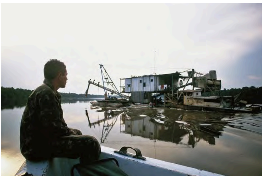
Authorities seized this illegal gold dredge on the Jutai River, near the boundary of the Javari Indigenous Land, during an expedition in 2002.