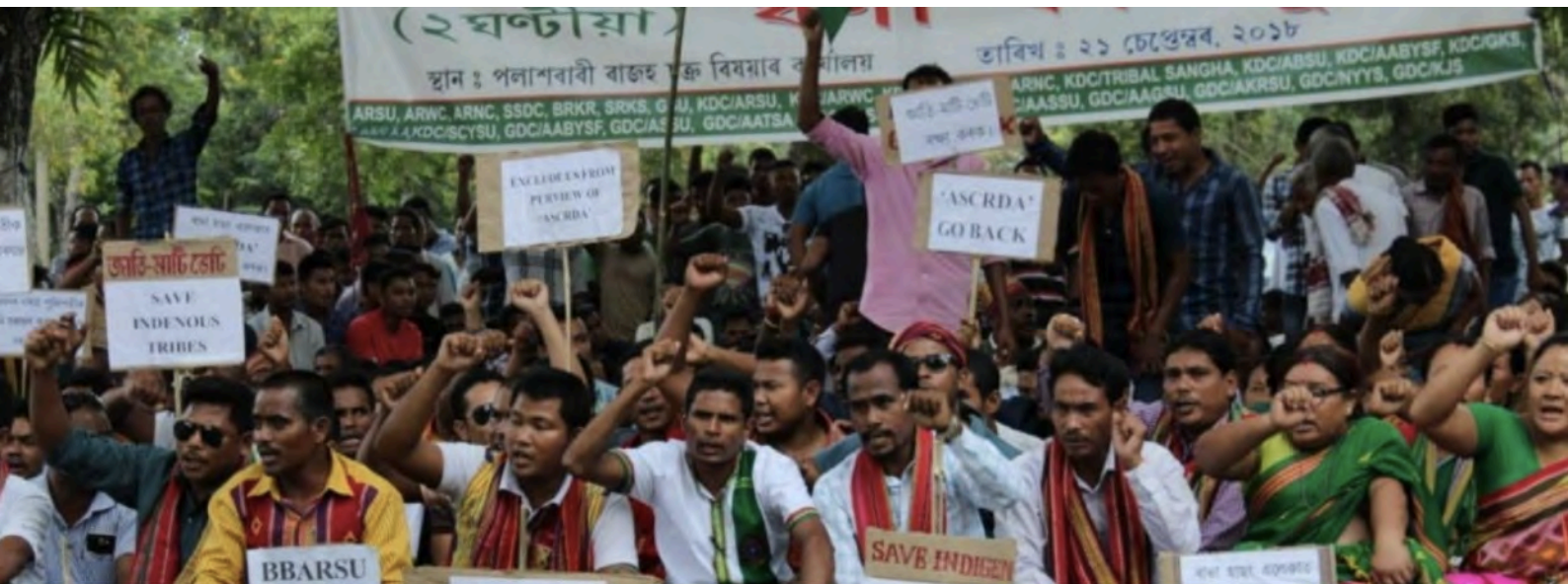
Rabha tribals protesting their incorporation under the Assam State Capital Region Development Authority.

“If the last vestiges of India’s natural forest cover and biodiversity hot spots remain intact in some pockets of the Northeast border areas, it is thanks to the tribal communities’ protection. A recent visit to the Rabha – a tribal community residing in the Assam valley – provided a glimpse into the struggles they face in doing so.”