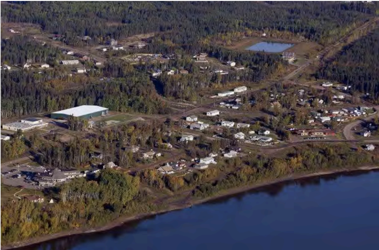
An aerial view of Fort McKay, Alta, Monday, Sept. 19, 2011. The Alberta government has released a draft plan for managing a contentious area that holds both oil sands resources and culturally significant Indigenous lands. The plan for Moose Lake, north of Fort McMurray and heavily used by the Fort McKay First Nation, will now go through a period of public consultation. (Photograph by The Canadian Press/Jeff McIntosh; as cited by Weber, 2018)