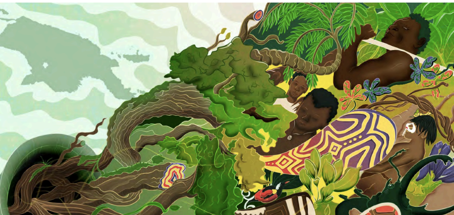
Illustration by MURUGIAH for The Gecko Project (The Gecko Project, 2018)

The Gecko Project has produced an exceptional piece of investigative reporting for its Indonesia for Sale series, an in-depth series on the opaque deals underpinning Indonesia's deforestation and land-rights crisis. The secret deal to destroy paradise is the third instalment.