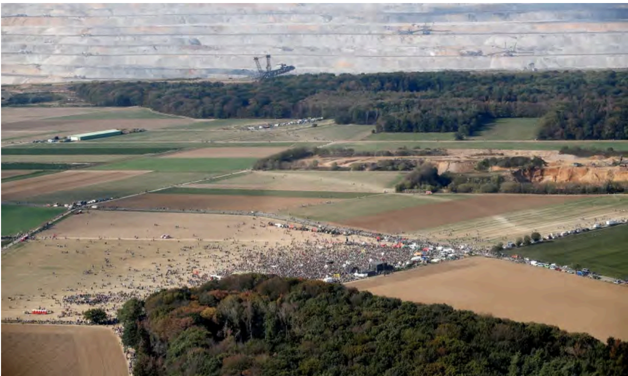
Protesters against the destruction of the forest with the current open cast mine in the background. (Photograph: Wolfgang Rattay/Reuters; as cited in Connolly, 2018)